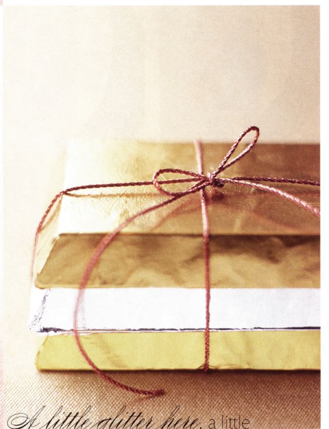
A little glitter here, a little glam there. Give your treats and favors the GOLDEN (or silver or brass) touch, and they'll be the star attractions.